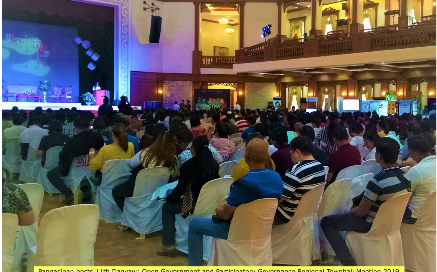
Pangasinan hosts 11th Dagyaw: Open Government and Participatory Governance Regional Townhall Meeting 2019 on August 22, 2019 at the Sison Auditorium, Lingayen, Pangasinan.

In its earnest effort to promote participatory governance, the Department of the Interior and Local Government (DILG), Department of Budget and Management (DBM), with full support from the Presidential Communications Operations Office (PCOO), conducted the 11th Dagyaw: Open Government and Participatory Governance Regional Townhall Meeting 2019 on August 22, 2019 at the Sison Auditorium, Lingayen, Province of Pangasinan.